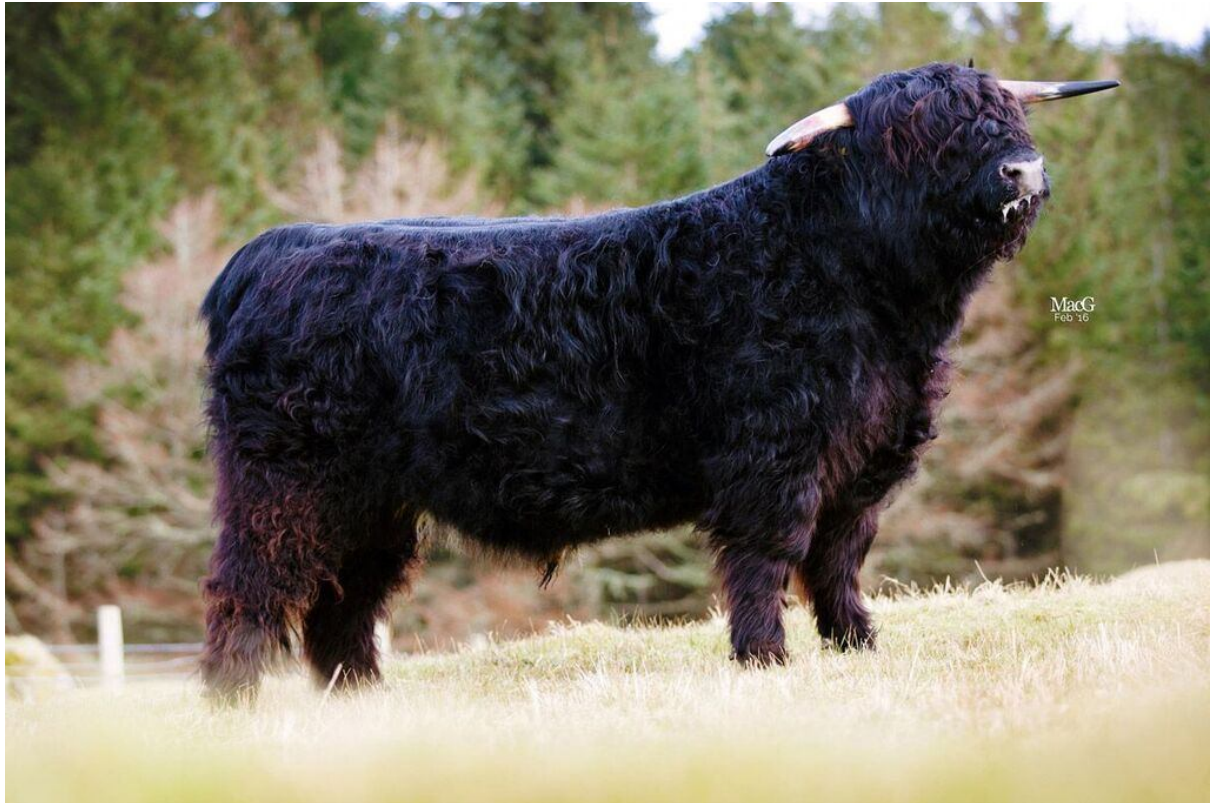
Cathag Dubh of Craigowmill